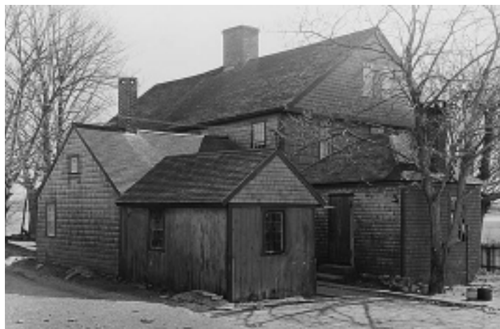
Photo of the rear view of the historic Stanton-Davis Homestead