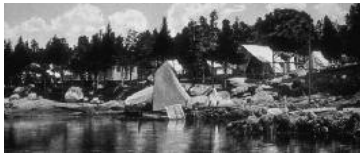
Mason's Island Camps from vintage postcard