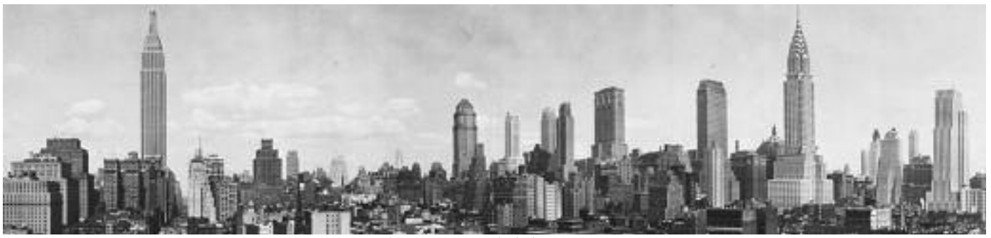
Mid-town New York skyline circa 1931