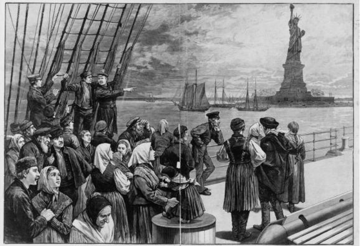
Caption reads "New York - Welcome to the Land of Freedom - an Ocean Steamer Passing the Statue of Liberty - Scene on the Steerage Deck", Frank Leslie's Illustrated Newspaper, June 2, 1887, Library of Congress archives.

The more mundane lesson, of course, is not to ignore the history in our own backyards. If your backyard is anything like mine, you might be surprised what you find!