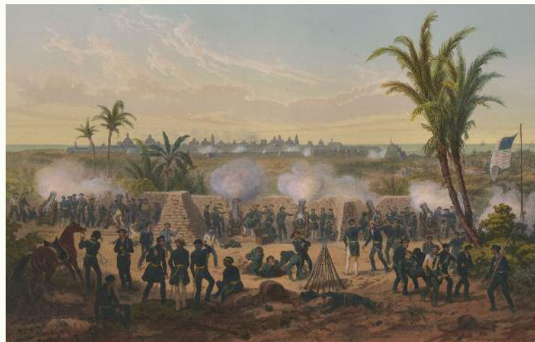
The Battle of Vera Cruz. Bombardment of Vera Cruz (March 1847) in the Mexican-American War ~ 1851 Lithograph engraving by Adolphe Jean-Baptiste Bayot based on painting by Carl Nebel. Wikipedia