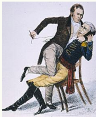
"Symptoms of a Locked Jaw"

With that old Travelers monograph in hand, I decided to check out past presidential elections regarding "civility". Why not start with the election of 1820? It was acclaimed as the "Era of Good Feelings", in which James Monroe ran unopposed (the third and last time that would occur). Amusingly, an election with no effective opposition concluded with a fistfight in Congress over the issue of whether Missouri's electoral votes should be counted, even though its votes didn't matter one way or the other. The good feelings of 1820 evaporated quickly and the 1828 election between Andrew Jackson and John Quincy Adams sank into a vitriolic swamp of sloganeering. Adams's campaign, managed by Henry Clay, subjected Jackson to a merciless stream of propaganda regarding