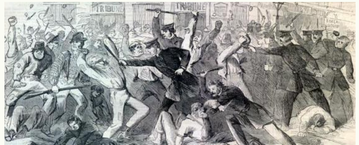
A depiction of New York's race riot response to 1863 conscription laws.

I knew that blacks suffered in the riots, but not the extent. Rioters blamed blacks as the cause of the war and their own misery - targeting black businesses and homes, and attacking blacks at random, even children. Blacks were beaten, mutilated, dragged through the streets, and lynched from lampposts. Puzzled by my basic ignorance of the facts, I wondered about what I really knew about the black experience in the north before and during the Civil War. Not much, it turns out.